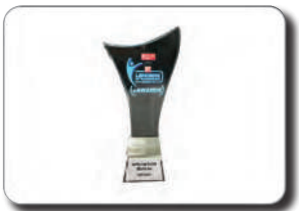
Logistics SME of the year 2020