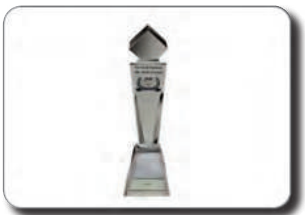
SME Business Excellence Award 2019

Best Temperature Controlled Pharma Logistics Service Provider - 2022